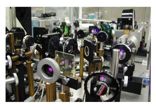
Structural change of light-driven proton pump

Time-resolved observation of protein dynamics spanning from picoseconds up to milliseconds